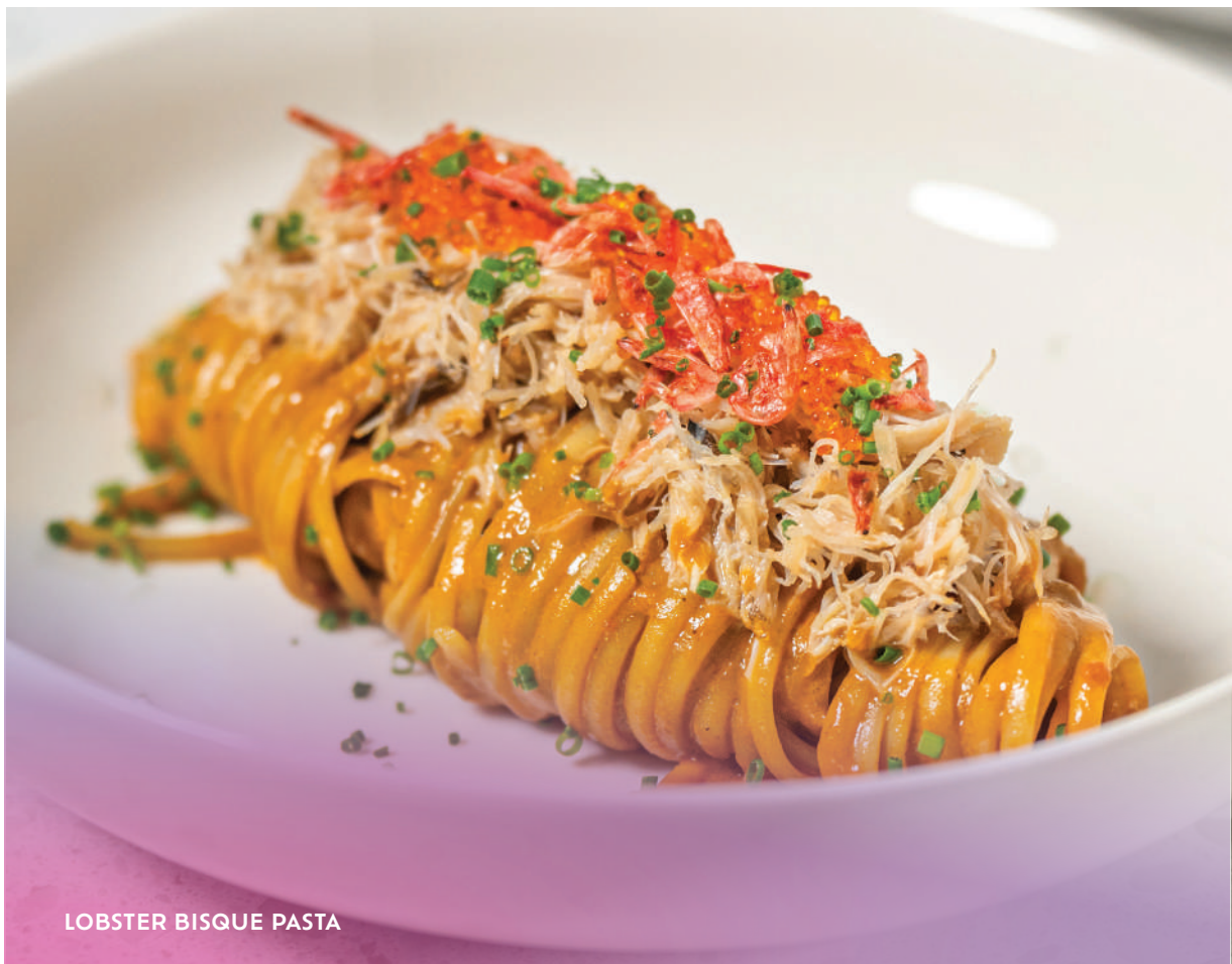
LOBSTER BISQUE PASTA

Spaghetti, Grilled Emperor Prawn, Extra Virgin Olive Oil, Dashi Broth, Garlic, Chives, Garlic Crumbs