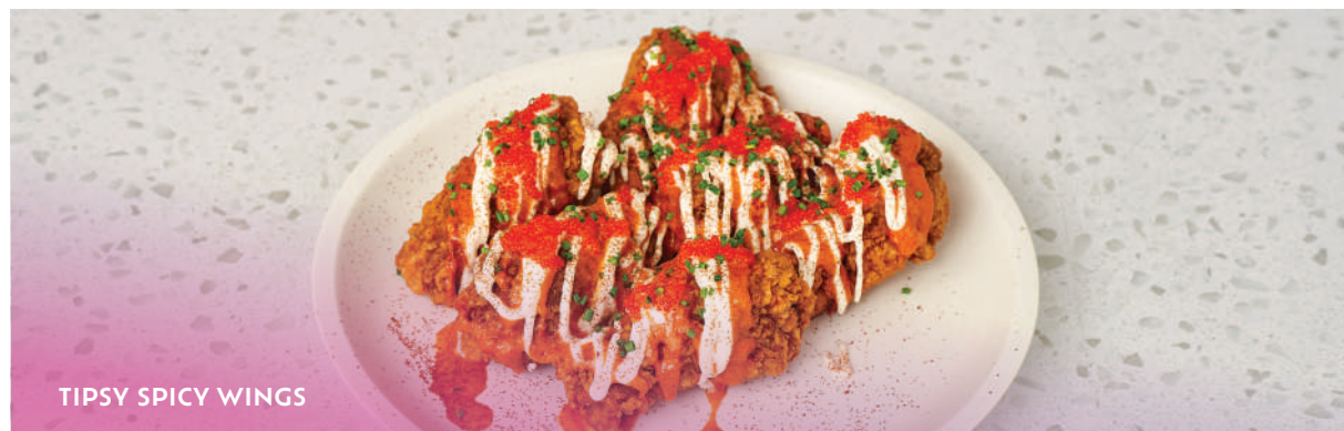
TIPSY SPICY WINGS