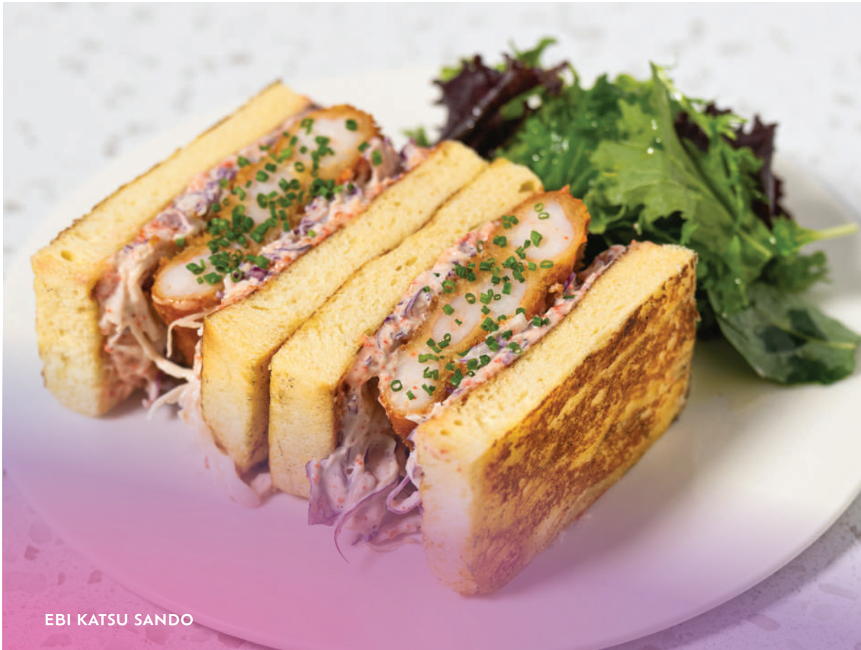
EBI KATSU SANDO